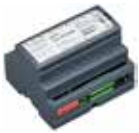
DDLEDC605GL PWM Controller

Due to continuous improvements and innovations, specifications may change without notice.