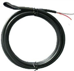
Figure 3. Temperature Sensor (TTS/APR1.0)