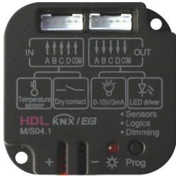
Figure 1. KNX 4-Zone Dry Contact Module

Datasheet Issued: June 17, 2019 Edition: V1.0.0